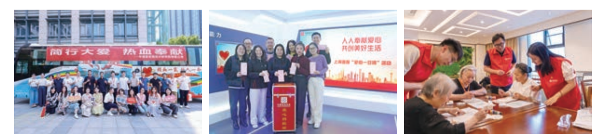
The Group encourages its staff to actively participate in and organize various types of voluntary services and activities

Adhering to employee-centric principle, the Group focuses on strengthening employee care, and actively launches the employees' sense of happiness program. It pays attention to the thoughts, work and life dynamics of employees, utilize platforms such as the "Digital Union" to timely understand employees' needs, thoughts, and expectation, and find ways and means to solve the urgent, difficult and worrying problems of employees, in order to continuously improve their sense of security, sense of gain, sense of achievement, sense of belonging and sense of happiness. The Group insists on "sending warmth in winter and coolness in summer", offers "five visits and five congratulations"*, and always offers visits during festivals to retired employees, advanced and model workers and employees in difficulty.