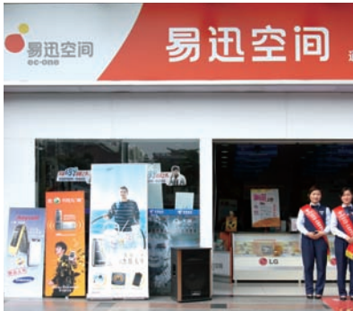
Retail outlet — “ec·one”