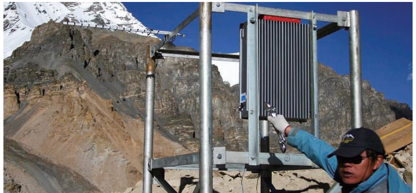
Base station installation at Mount Everest

spread to domestic communications industry and will place pressure on the pricing and profitability of our telecommunications infrastructure services.