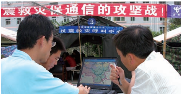
Undertaking communications resumption plan on disaster site