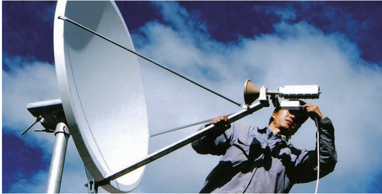
Satellite communications system construction project in rural Tibet