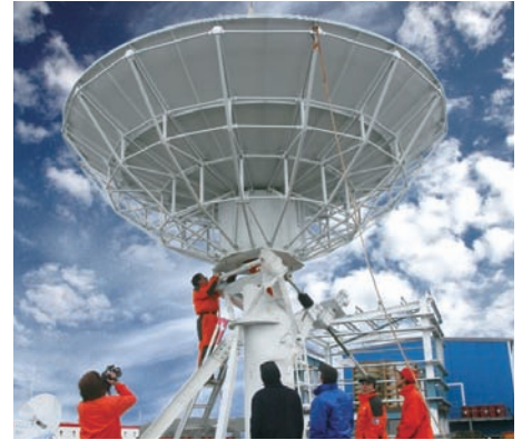
Satellite communications system construction project in "Chang Cheng" station, South Pole