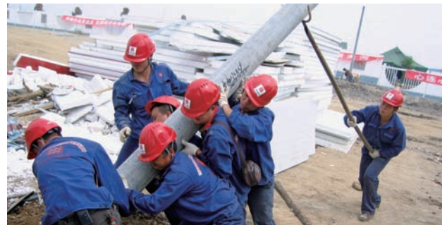
Restoring telecommunications facilities on disaster site