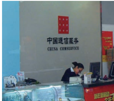
Service counter for telecom agency services