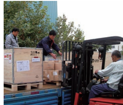
Logistic service for TD-SCDMA equipment