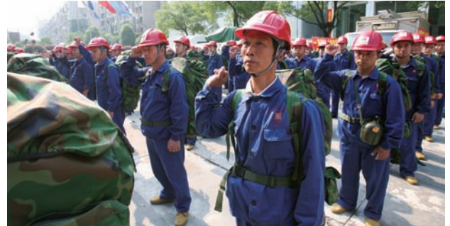
Organizing our staff for emergency rescue work