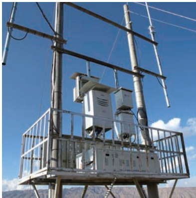
Base station installation in Tibetan Plateau