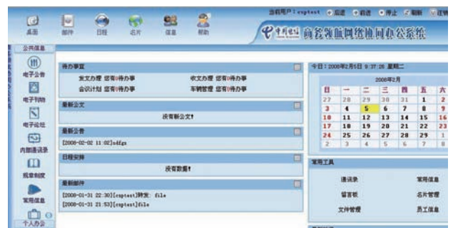
Operational, business and management supporting system (OSS, BSS, MSS) development