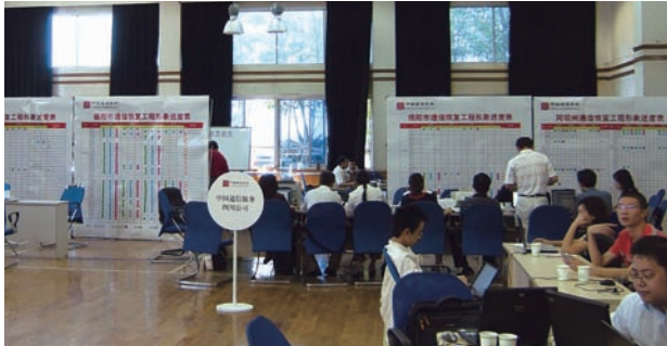
Disaster relief command centre for Wenchuan earthquake